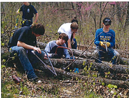
Service projects completed over the weekend included replacing the roof on the Director's Cabin, a drainage system in front of the camp office, and clearing a trail blocked after the ice storm.