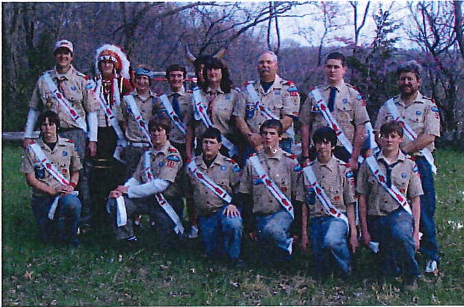
Twelve Arrowmen completed the Brotherhood honor at the Fellowship.