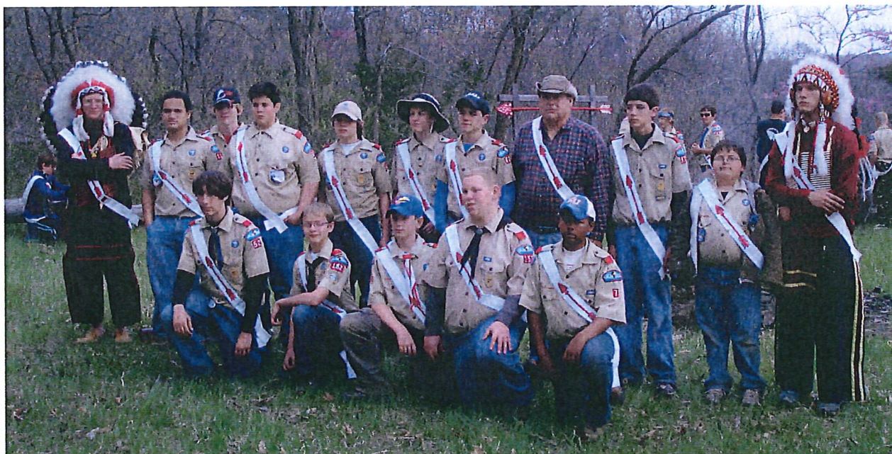
Fourteen Scouts selected by their brothers for outstanding dedication to the ideals of Scouting braved unseasonably cool temperatures and a frigid coating of frost Saturday morning as they completed the Ordeal and were welcomed into our honored Brotherhood.